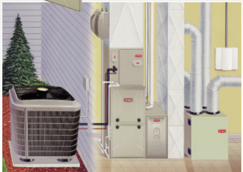
HYBRID HEAT® Deluxe Heat Pump and Deluxe Gas Furnace System