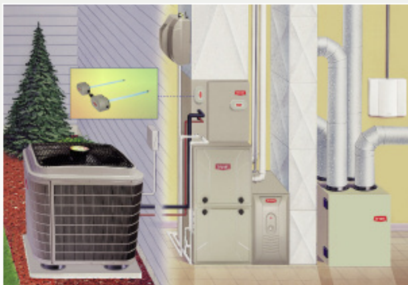
Air Conditioner and Gas Furnace System